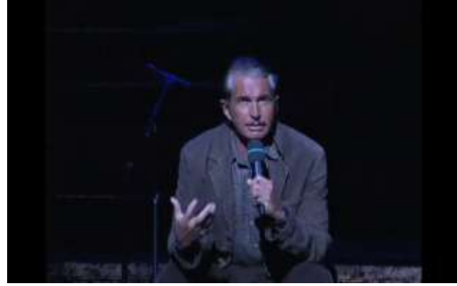
George Hamilton, Broadway and Film Actor, speaks at a Chicago Day on Broadway